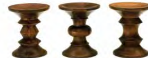
a b c

$ 995 Please allow up to five weeks for delivery